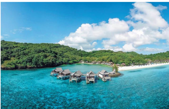
Panoramic view of Palau Pacific Resort

The Palau government has adopted as a goal the transformation of the Republic into an ecotourism destination for high-end visitors in order to strike a balance between protecting its natural environment and developing its tourism industry. Taking advantage of its highly rare location where abundant forms of nature can be simultaneously experienced by virtue of being surrounded by the West Pacific Ocean rich in marine life and forests inhabited by numerous bird species including those unique to Palau and even endangered ones, Palau Pacific Resort will continue bolstering further initiatives going forward with a view to that goal.